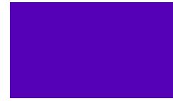
72 57190 Derby Blue