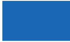
12 57174B Cyan Blue