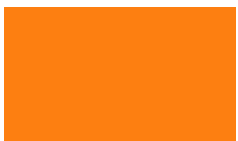
17 57701 Orange