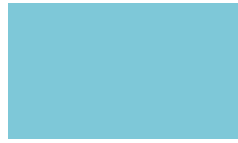
12 57172 Light Blue