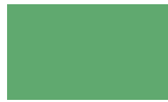
11 57473 Apple Green