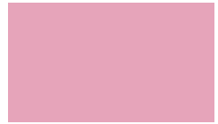
77 1640 Rose