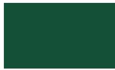
11 57472 Blue Green