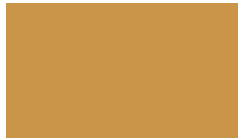
16 57871 Light Brown