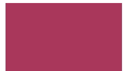
77 1644 Maroon