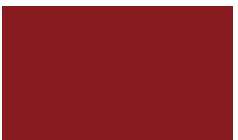
77 1645 Dark Maroon