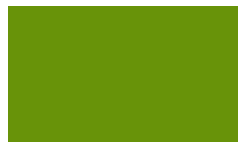
11 57471 Chrome Green