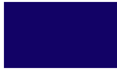
72 57193 Delft Blue