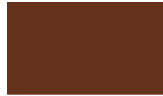
16 57872 Dark Brown