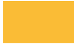
13 57372 Ochre