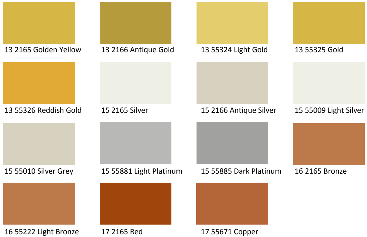
Fig. 1: Color samples of the Metallic100 series

While every attempt has been made to reproduce colors exactly, the samples printed here may differ slightly from the finished ceramic products.